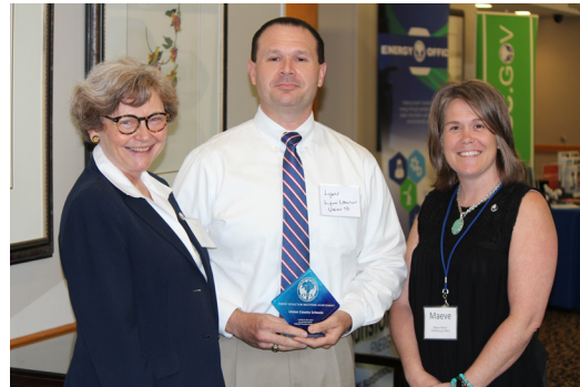
Union County School District