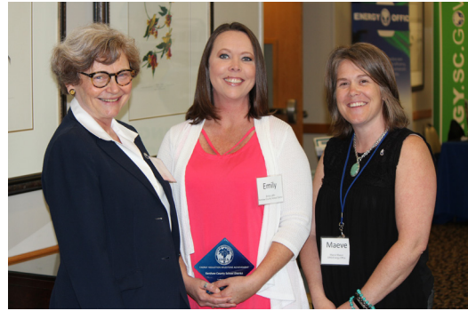
Kershaw County School District