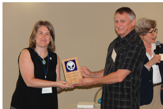
Trident Technical College